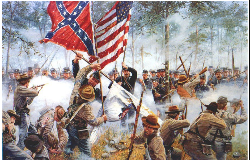
(Battle of Gettysburg- July 1863)