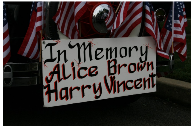
(July 4th Historical Society Remembrance)